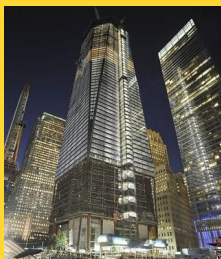
WTC In Progress